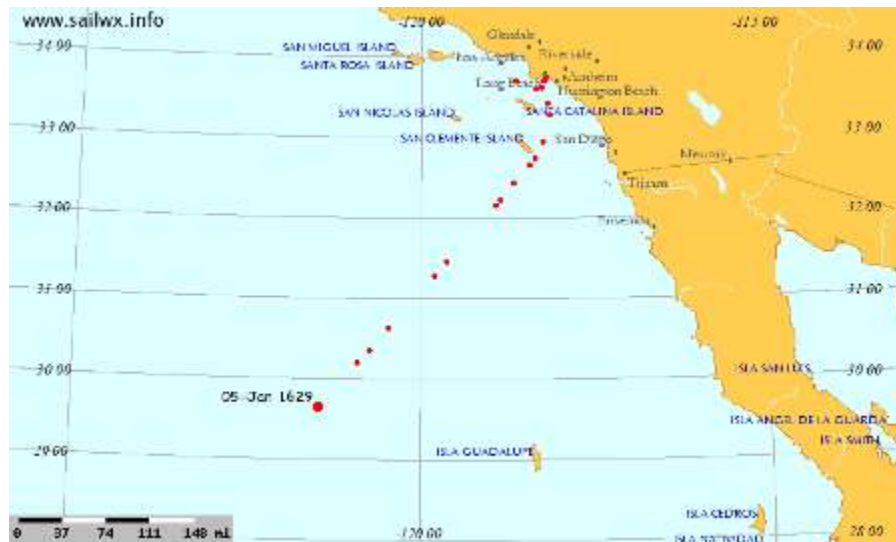
The route of the American Tern after Christmas.