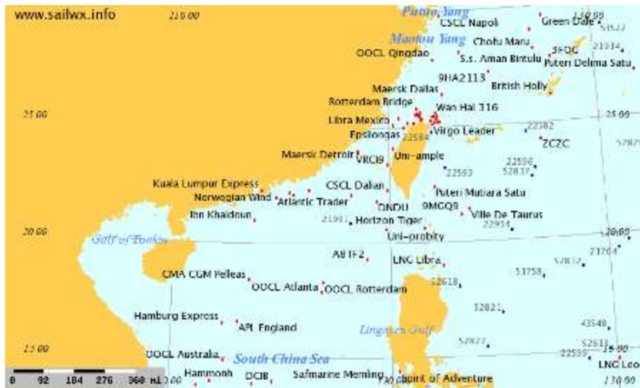
The general area of the Dec 23 location report