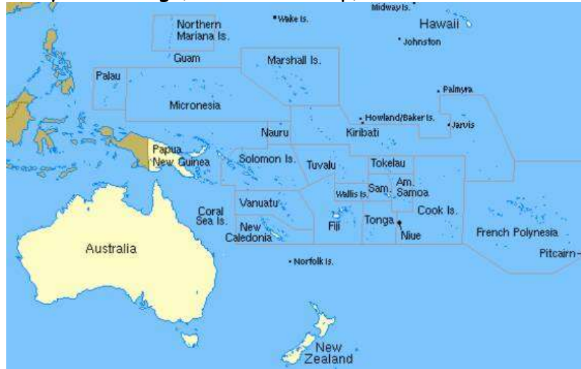
In case you didn't know where Palau is.

Sorry, I don't have actual location. Christmas Day: Karl Heimbrock (2011A) was 40 feet down, scuba diving on a reef off of Palau. New Years Eve: Slept on the beach on Palau. Currently: Steaming (MSC steam ship) to Guam.