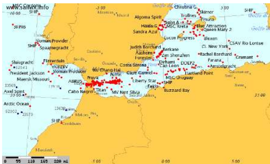
Sarah's general location Christmas Day.

Sarah Smith (2012A) was at Lat. 36-25.3 N Long. 002-05.30 W and went through the Straits of Gibraltar that night. New Years she was in the middle of the Atlantic at Lat. 26-36 N and Long. 052-42 W. She has since been in Beaumont TX and Charleston SC. The Alliance New York (KDUE) is headed back to Kuwait and Karachi with tanks, Hummers and stuff.